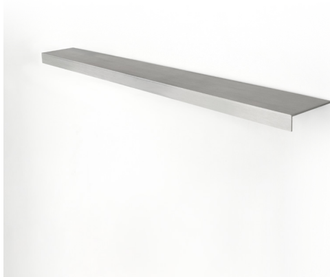
□ Outer surface