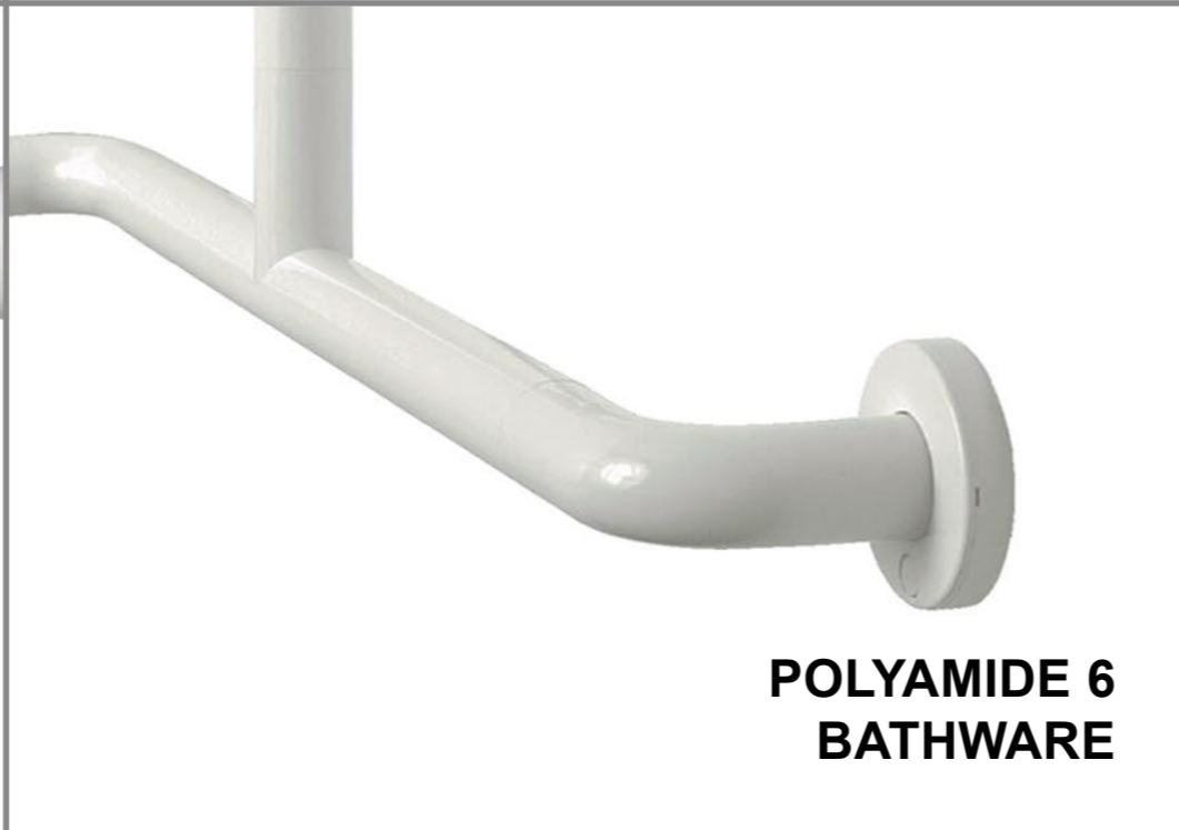
POLYAMIDE 6 BATHWARE